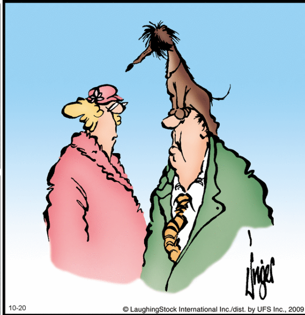
"It's a Siberian mountain dog."