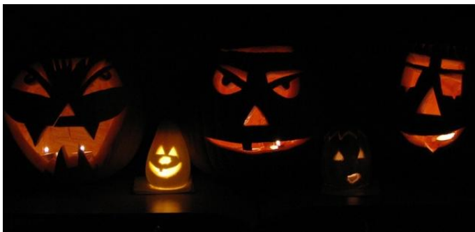
Jack-o-lanterns made by students at the English Club Café Halloween Party, 23 October, 2009 at Fabrika