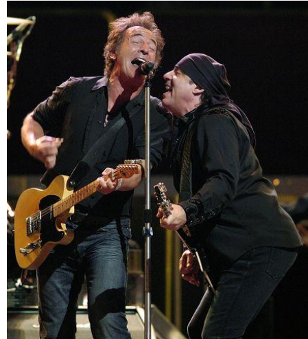
Bruce Springsteen at a Superbowl halftime