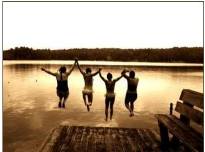
Above: Taking a Dip