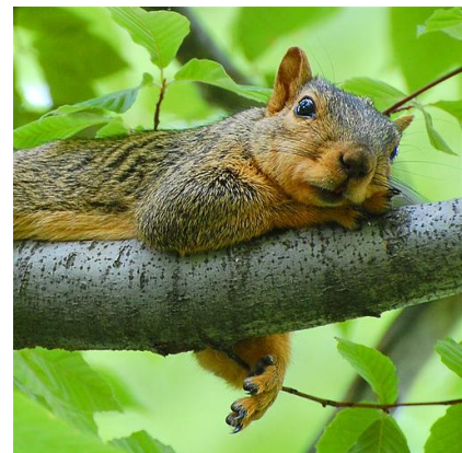
Below: A Squirrely summer nap